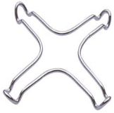
GRM Gas hobs moka support