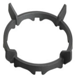
WOKGHU Cast-Iron WOK Support